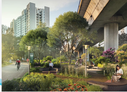
▲ Rest stop along Choa Chu Kang Park Connector provides a space for rest and relaxation.

增進與新加坡地產區更具健康的體驗，這包括建設以身心健康的休憩空間，以及一系列不同的康樂和體育設施，包括長跑與越野跑的生活方式。