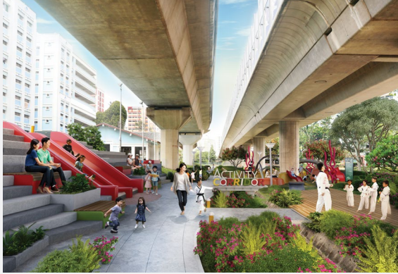
▲ Play and event space at residents' doorstep.