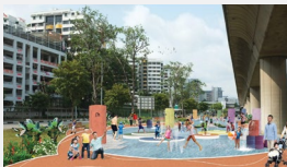
▲ A new water play feature for families to enjoy.

Restorative and therapeutic spaces will be introduced. There will also be recreational and sports facilities, such as the Brickland Sport-in-Precinct and BMX tracks, to support active lifestyles.