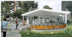
▲ A large community pavilion for activities and gatherings.

Yew Tee Lifestyle Corridor Spanning from the Pang Sua Canal to Yew Tee MRT station, the Yew Tee Lifestyle Corridor will feature elements from Yew Tee's rich history.