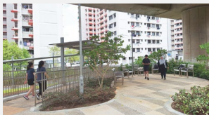
▲ Improved sheltered connectivity with linkways.

Limbang Green Spine Provides resting places, sheltered linkways and new fitness equipment to encourage healthier lifestyles.