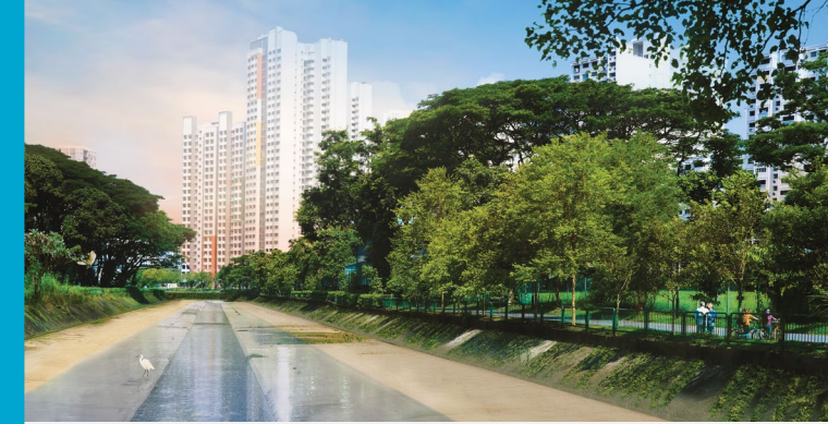
▲ Canal will be beautified with creepers along its walls.