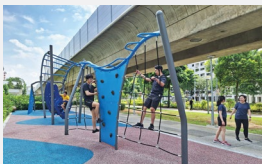
▲ New fitness equipment reminiscent of Ninja Warrior.

Yew Tee Lifestyle Corridor Spanning from the Pang Sua Canal to Yew Tee MRT station, the Yew Tee Lifestyle Corridor will feature elements from Yew Tee's rich history.